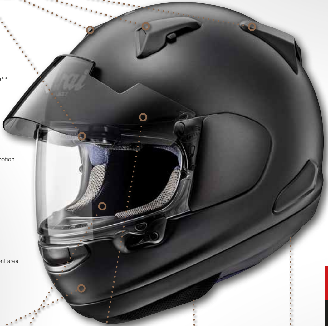
QV-PRO Frost Black

** Innovated and exclusively offered by Arai